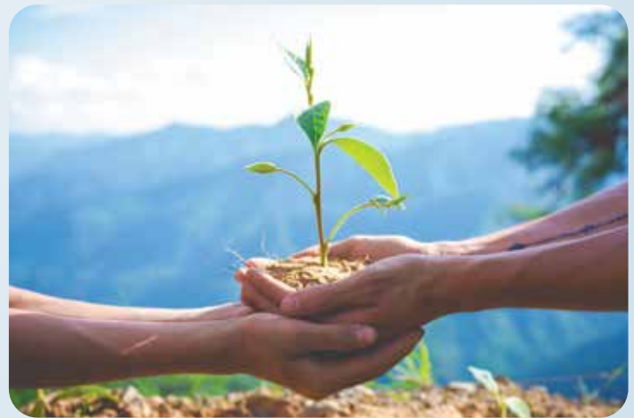
Canadian First Nations design embraces principles of sustainability and ecological stewardship.

Canadian First Nations perspectives in design represent the artistic expressions and cultural traditions of Indigenous communities across the country. With a deep connection to the land, rich storytelling traditions, and a profound respect for ancestral wisdom, First Nations design embodies the resilience, cultural identity, and spirit of Indigenous peoples. This article aims to explore the multifaceted nature of Canadian First Nations perspectives in design, highlighting their significance in preserving cultural heritage, promoting sustainability, fostering intercultural dialogue, and empowering Indigenous communities.